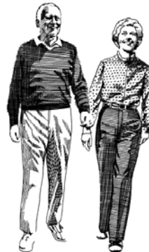
Harried To The Sea.com

You've never played Banking? It's easy. First, you give me the ball, and then I charge you every time you want to play with the ball. I'll also charge you if you want to give the ball to someone else, and a small monthly fee for holding onto your ball.